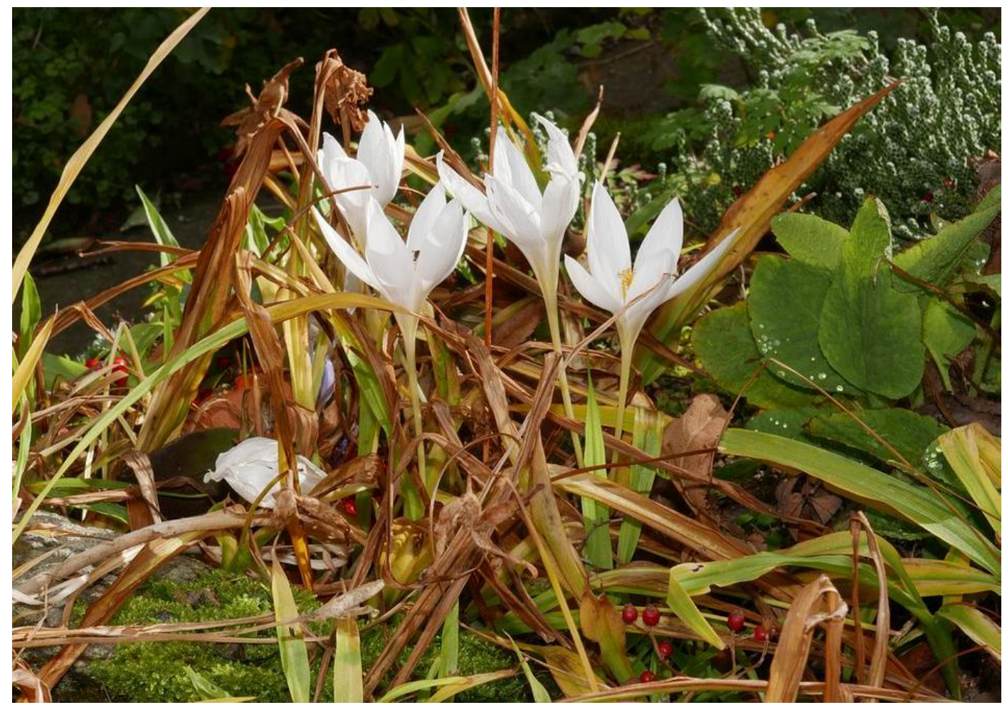
Crocus speciosus hybrid.