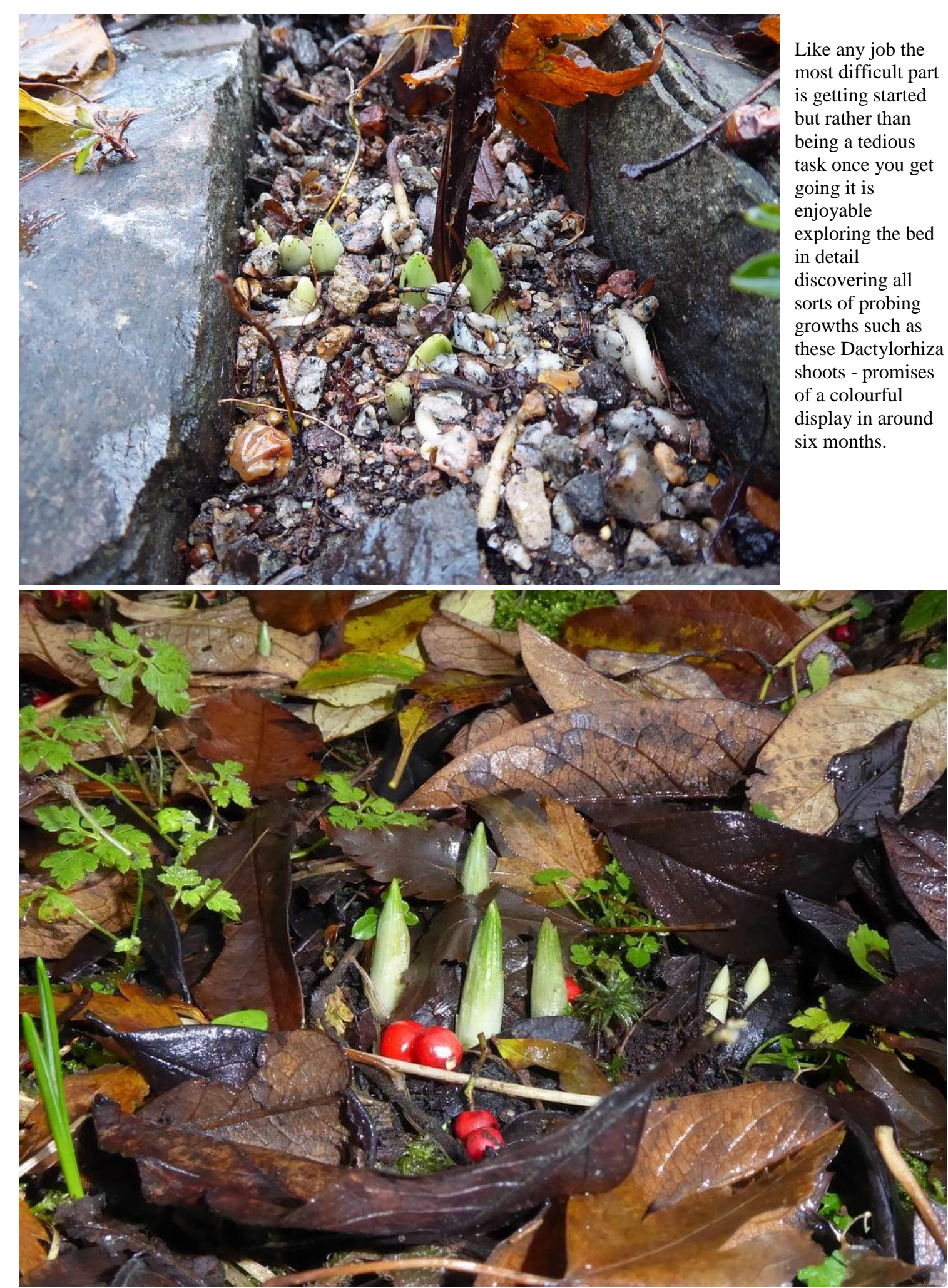
On the other hand these Iris 'Katherine Hodgkin' buds will make their colourful floral display much sooner as they are among the earliest bulbs to flower in February.