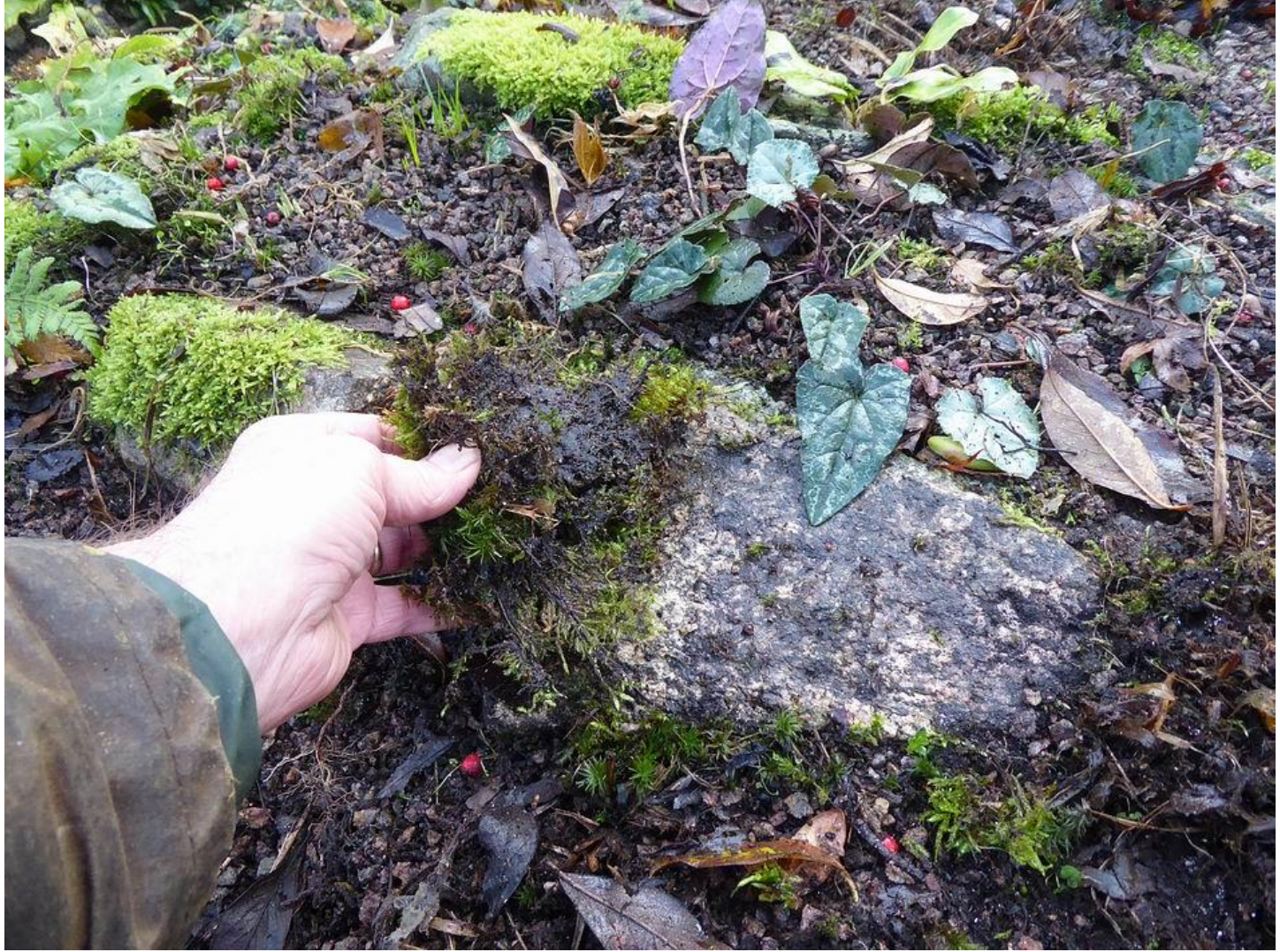
Peeling the moss off.