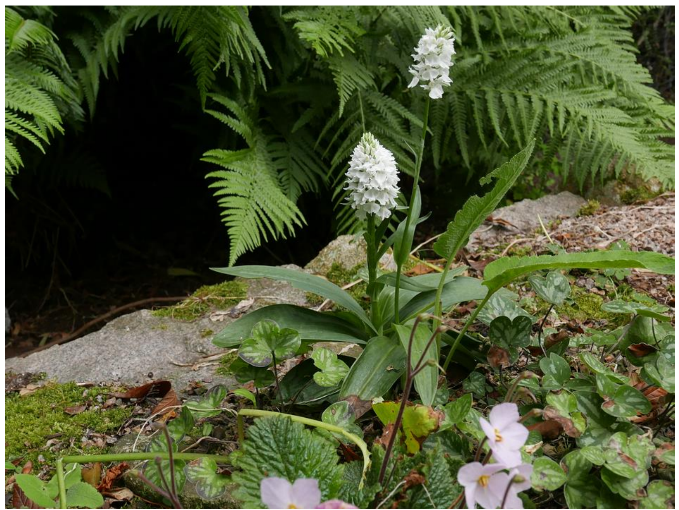
Dactylorhiza and Ramonda myconii