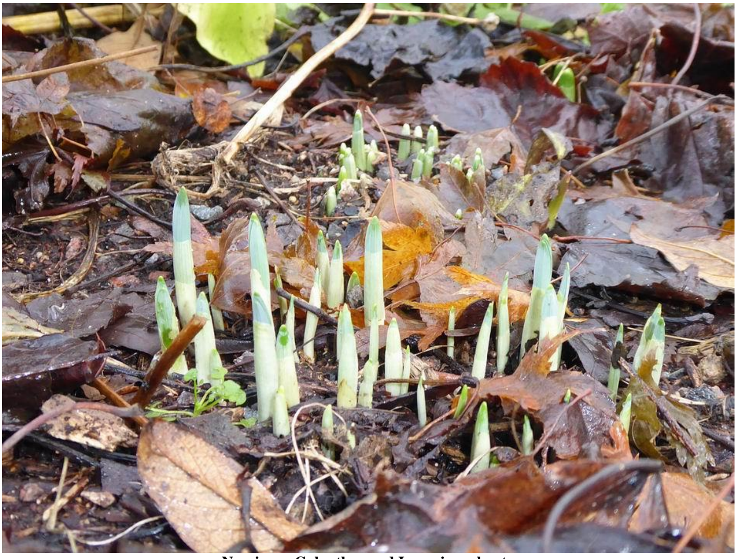
Narcissus, Galanthus and Leucojum shoots.

With the winter solstice fast approaching it is cheering to have Galanthus reginae-olgae flowering in the bulb house. There are some shoots in quite an advanced state poking through the open ground amid the fallen leaves. All these shoots are reminders that another season of garden delights is ahead of us and, like nature, I must make preparations for the early flowering bulbs by clearing the beds of the fallen leaves and debris of the old growths.