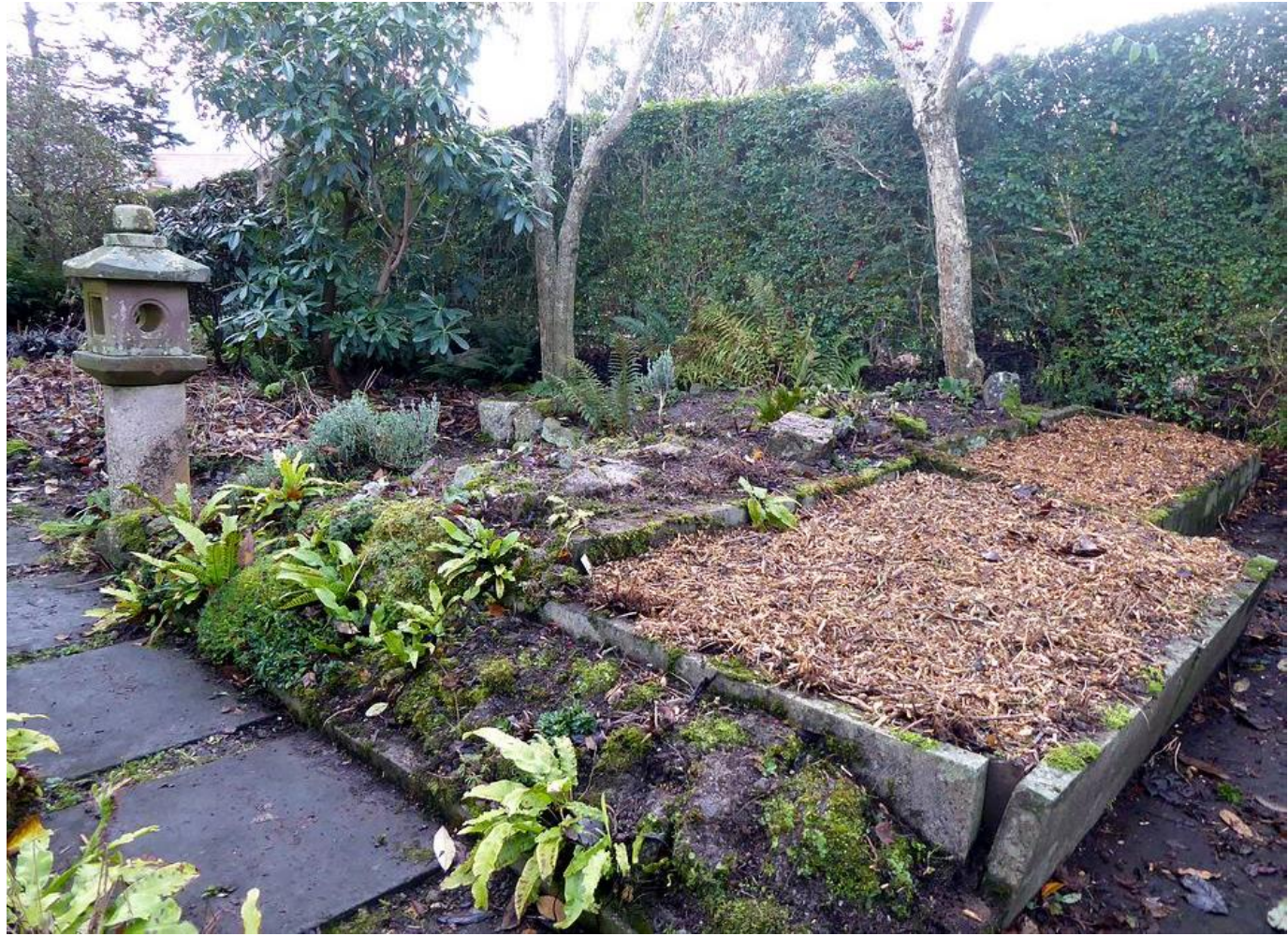
The hedge trimmed, the rock garden bed, the erythronium plunge and the path-side hepatica bed are also tidied, ready for the new season with another reminder below of how they will look in the months ahead.