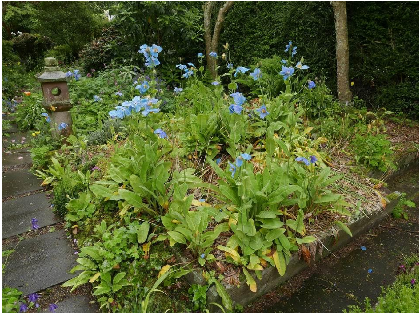
We did not plant any of these Meconopsis; this welcome invasion is entirely down to them self-seeding.