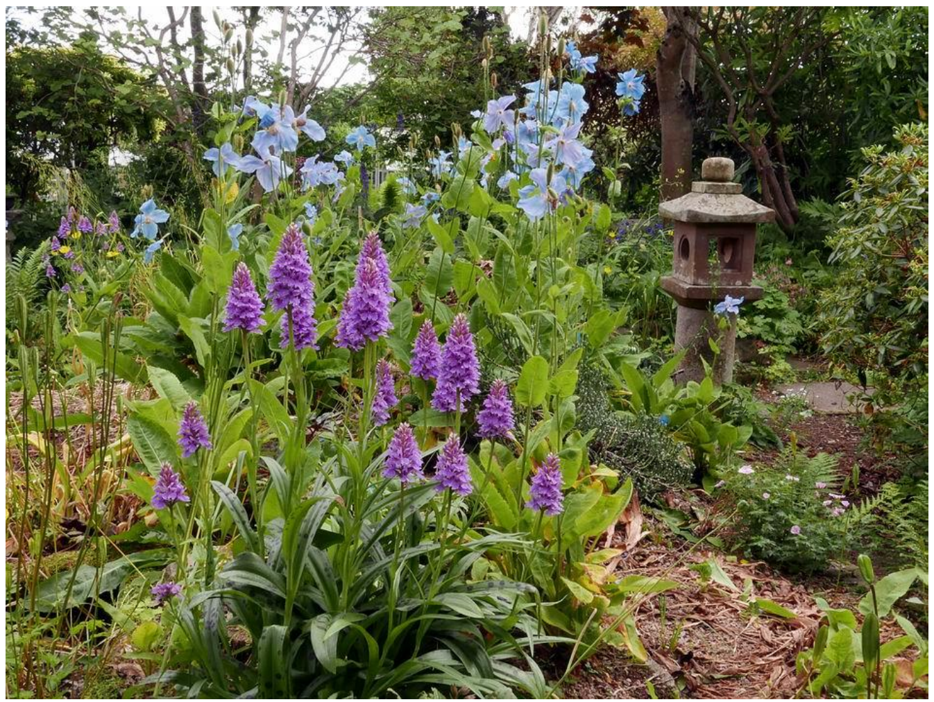
Dactylorhiza and Meconopsis