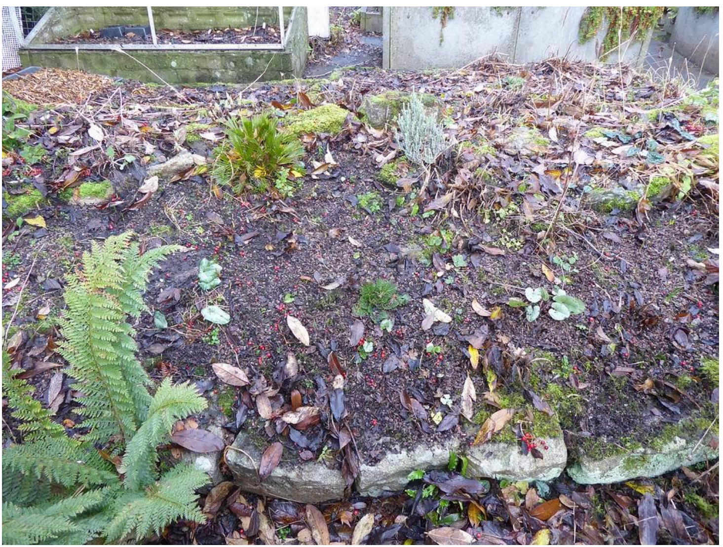
I start to remove the leaves and old growths using a combination of a rake and a leaf blower then when I can see the ground I can also remove any unwanted weeds.