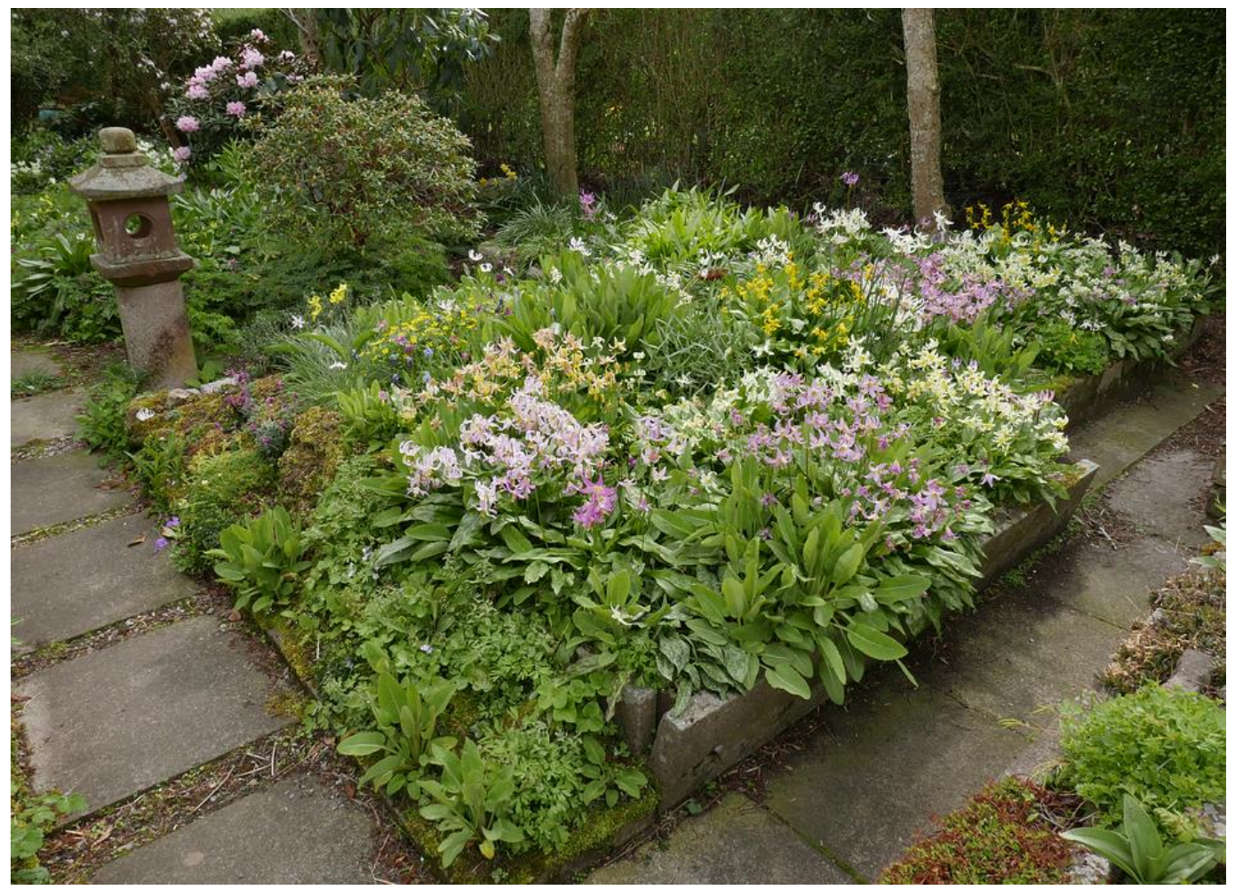
Looking forward to April.....